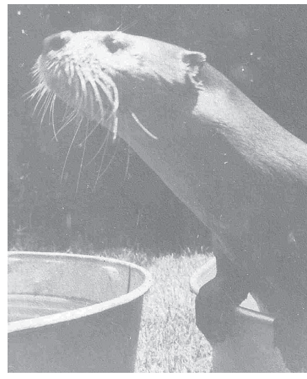
Tafi's long neck

and inspect the unfamiliar surroundings, he quickly stepped out of the room and shut the door behind him thinking a quick disappearance by the "parent" would prompt her to accept the new environment more readily.