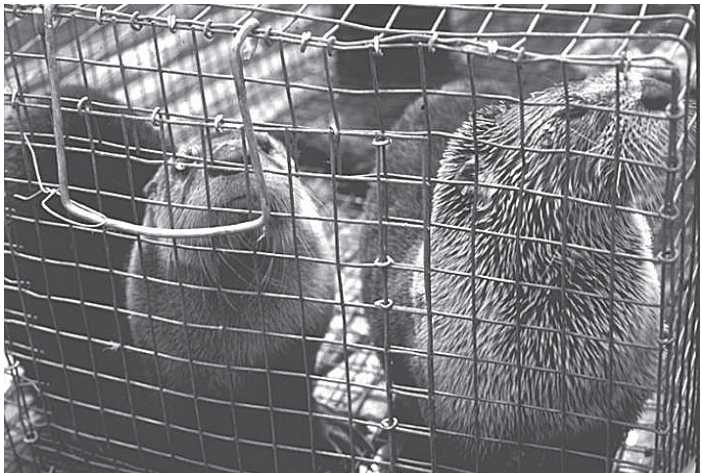
Otters ready for restoration program release

The MDC stocks fingerling fish in those that meet certain criteria, and free of charge. Most have a combination of largemouth bass, bluegill, and channel catfish.