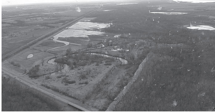
Typical otter habitat in north-central Missouri