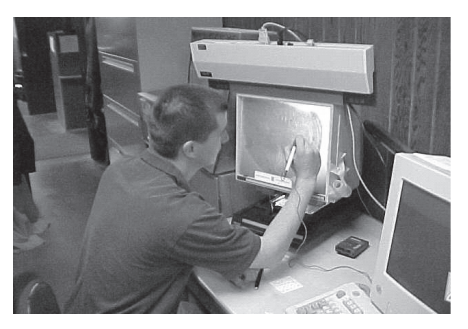
Missouri researcher studies otter diet

After two long years of looking at data, consulting with scientists, taking field trips to farm ponds and to wade along local streams searching for otter latrines and fish parts, and lots of wrangling, the team reached an agreement in principle. They agreed on a compromise that otter management zones would protect otters in low-density areas with a limited otter harvest, and provide much needed relief in the