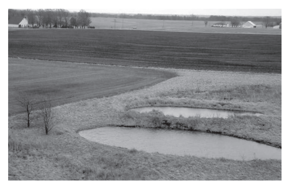
Small Missouri farm ponds where otter raised litter of pups