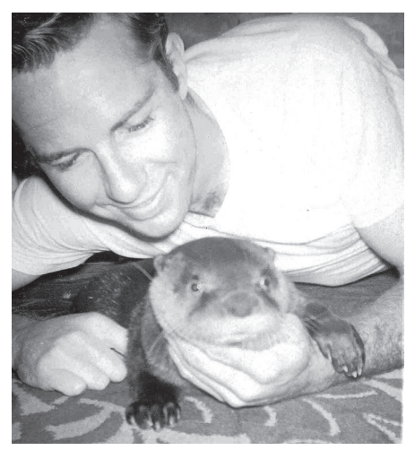
Tafi and Clark

Having established the basic requirements for food and sleep, we ventured on into the unknown territory of otter parenting. During the following days we watched a very curious Tafi acquaint herself with all the nooks and crannies of the apartment; but why does she drag herself around that way ?