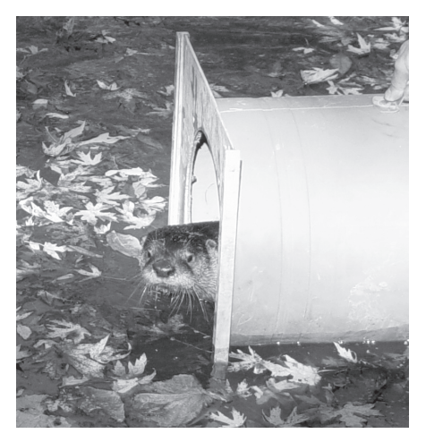
Radio-marked river otter release

Ozarks by adding a full month to the trapping season -- with no limit. For now, a five-zone approach helps us to direct the most intensive trapping pressure where it is most needed and allows a sustainable harvest of otters in other areas where we want otter populations to remain stable.