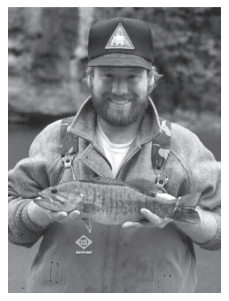
Happy fisheries biologist with smallmouth

At the peak of the otter population, we estimate we had somewhere between 15,000 and as many as 18,000 otters. We have documented otter densities as high as three otters per mile in some small streams, and the fish populations did decline. In most streams however, densities are about an otter per mile, and fish populations look good. This past season, trappers took over 3,000 otters.