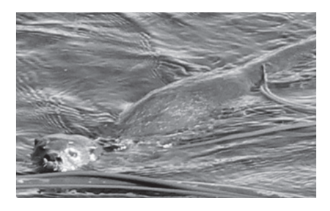
Marine Otter

In Chile, only during the last five years, governmental agencies have developed efforts to design marine reserve networks. However, much of those efforts are using the umbrella species approach under a pre-supposed base and few attempts to demonstrate this assumption have been done. This might have some considerable negative effects in the efficiency of marine biodiversity protection and future reserve management.